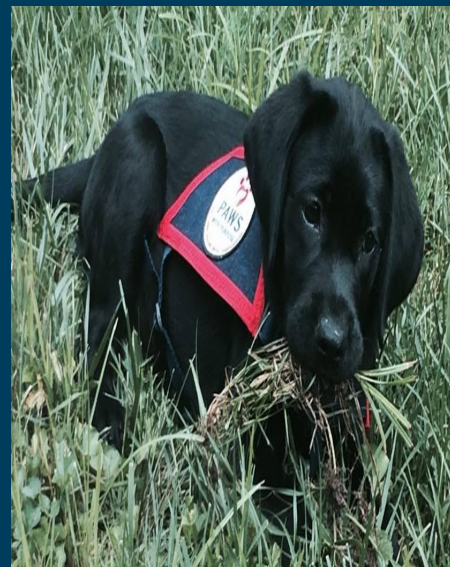
Gabby, our "G" puppy